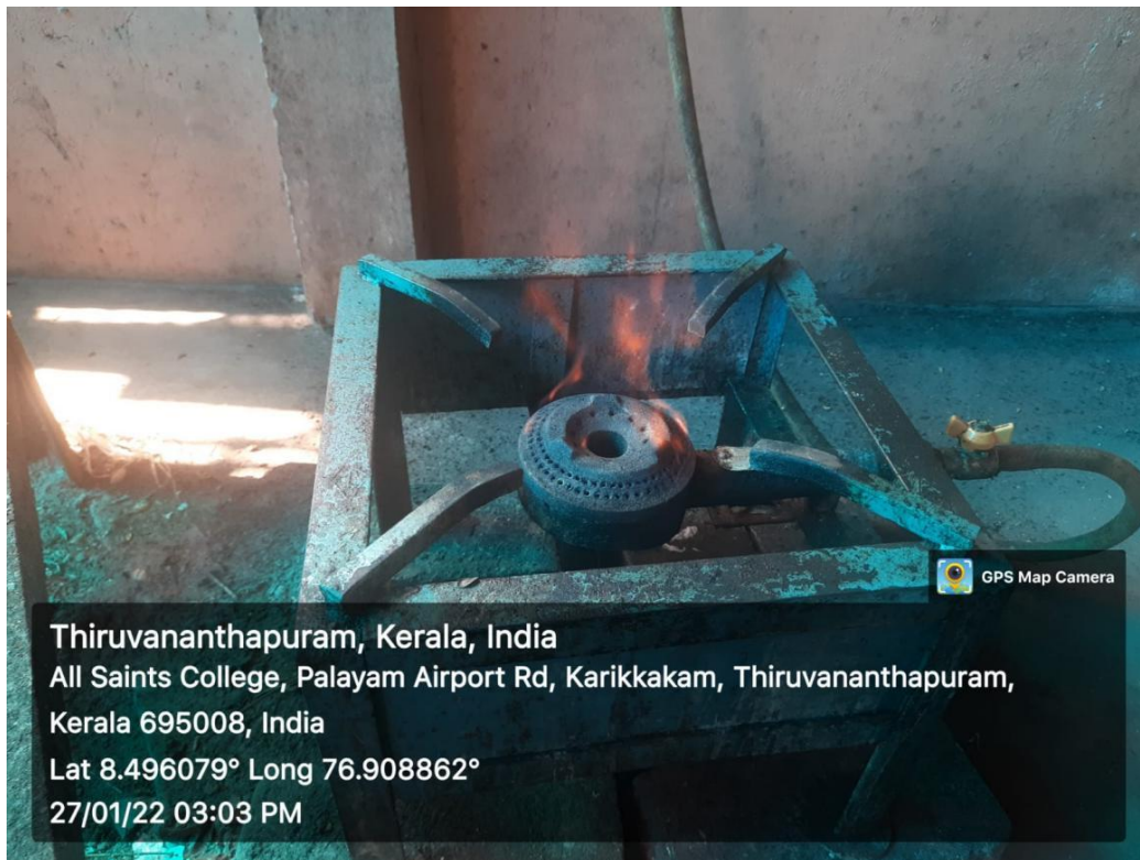
BIOGAS PLANT AND BURNER AT THE ALL SAINTS' COLLEGE CANTEEN