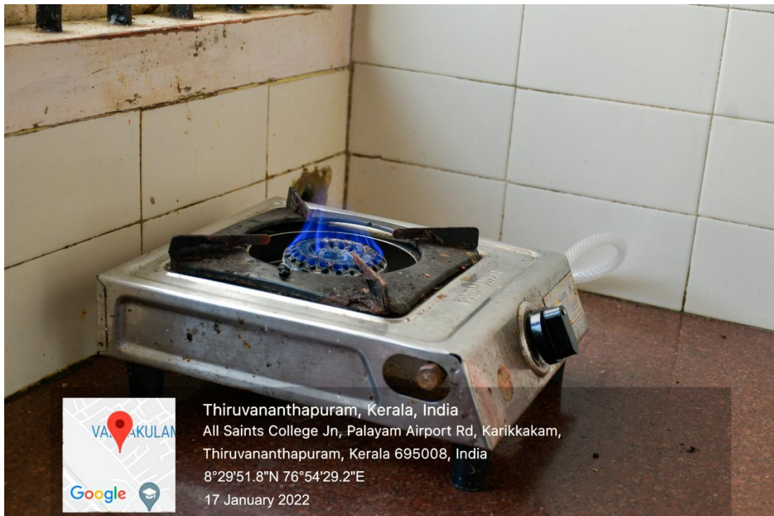
BIOGAS PLANT AND BURNER AT THE CCR GENERALATE IN ALL SAINTS' COLLEGE CAMPUS