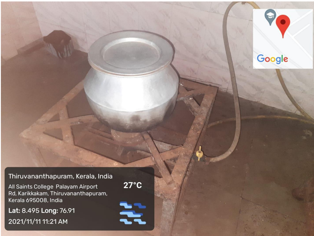
BIOGAS PLANT AND BURNER AT THE ALL SAINTS' COLLEGE HOSTEL