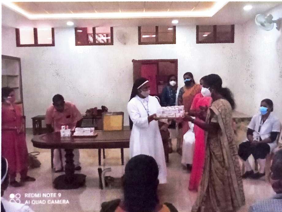
Distribution of POSTMA devices to the Health Centres