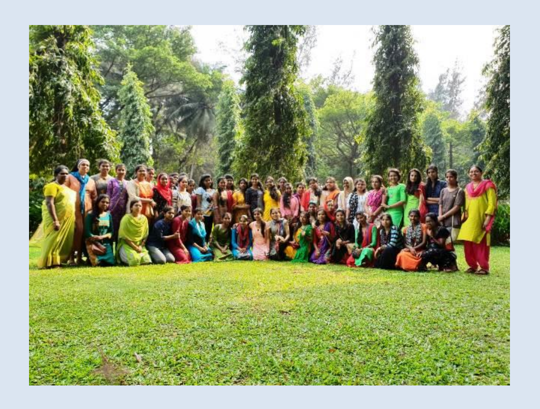
Field visit conducted for the SV Botany core students