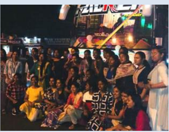
A Field trip to Marine Aquarium and proposed Harbour, Vizhinjam